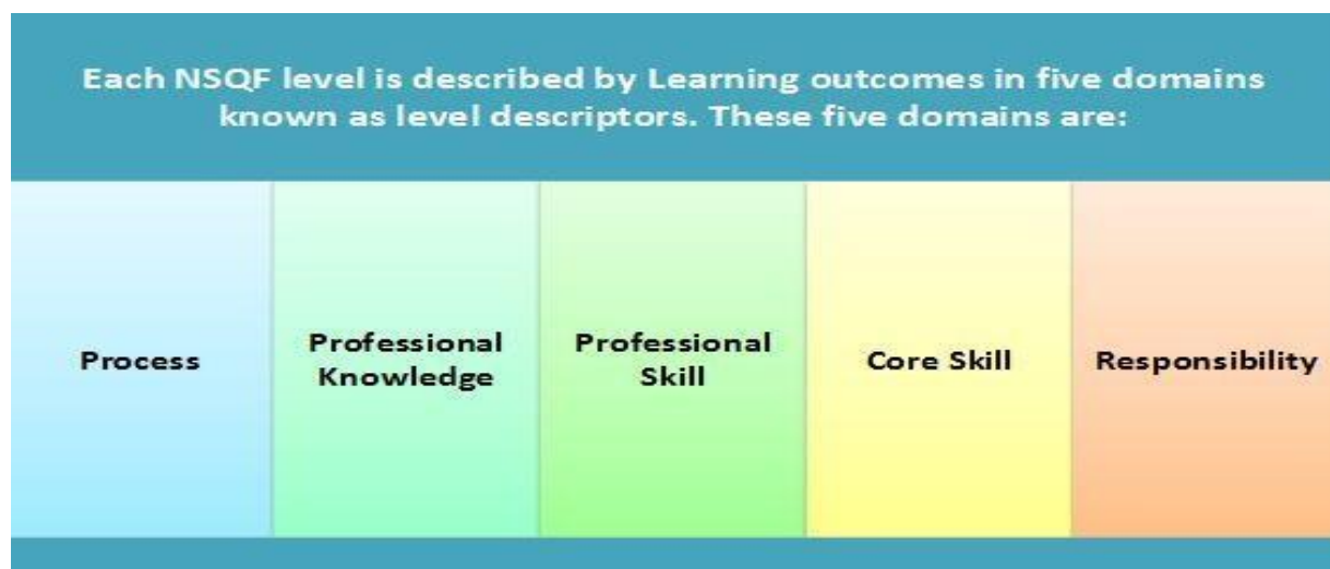
Fig.1: NSQF Domains

National Skill Qualification Framework has defined total Ten Levels. Each level of the NSQF is associated with a set of descriptors made up of five outcome statements, which describe in general terms, the minimum knowledge, skills and attributes that a learner needs to acquire in order to be certified for that level.